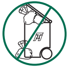
Keep lids closed