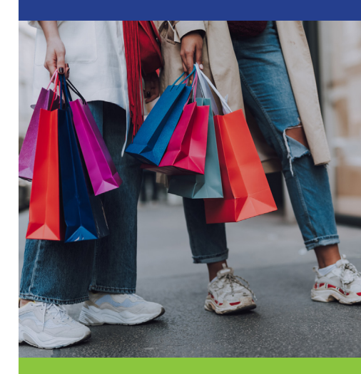
Summer Sidewalk Sale Downtown Los Altos August 5 – August 14